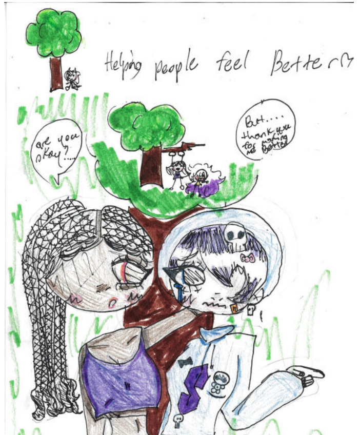
Illustrations by Healthy NewsWorks reporters at Philadelphia Hebrew Public Charter (above) and MaST Community Charter School (left)

After reading the book, students talked about how a good friend notices what makes you special and spent time sharing what they appreciated about each other. After this, students said that it made them happy and important to hear the nice things about themselves.