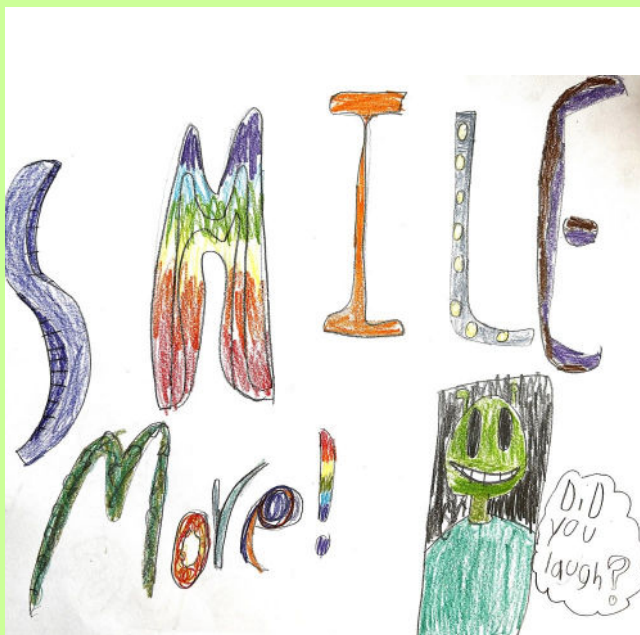
Illustration by Victoria Stangler